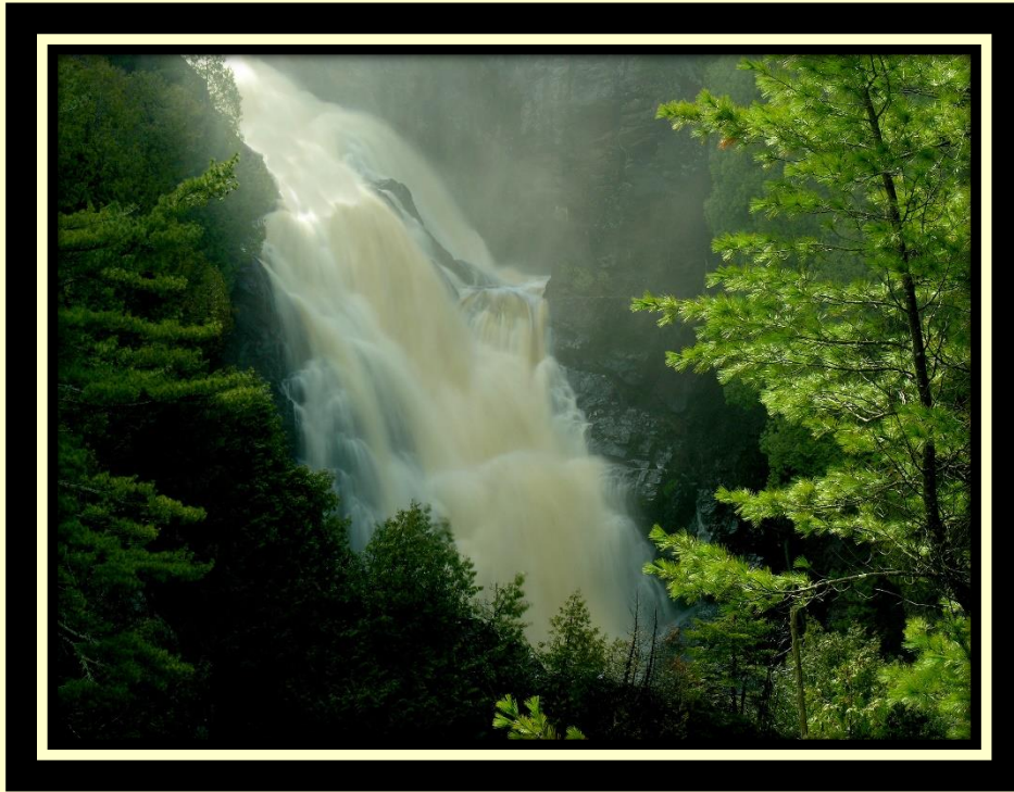
View from second overlook in early spring, photo spot #2