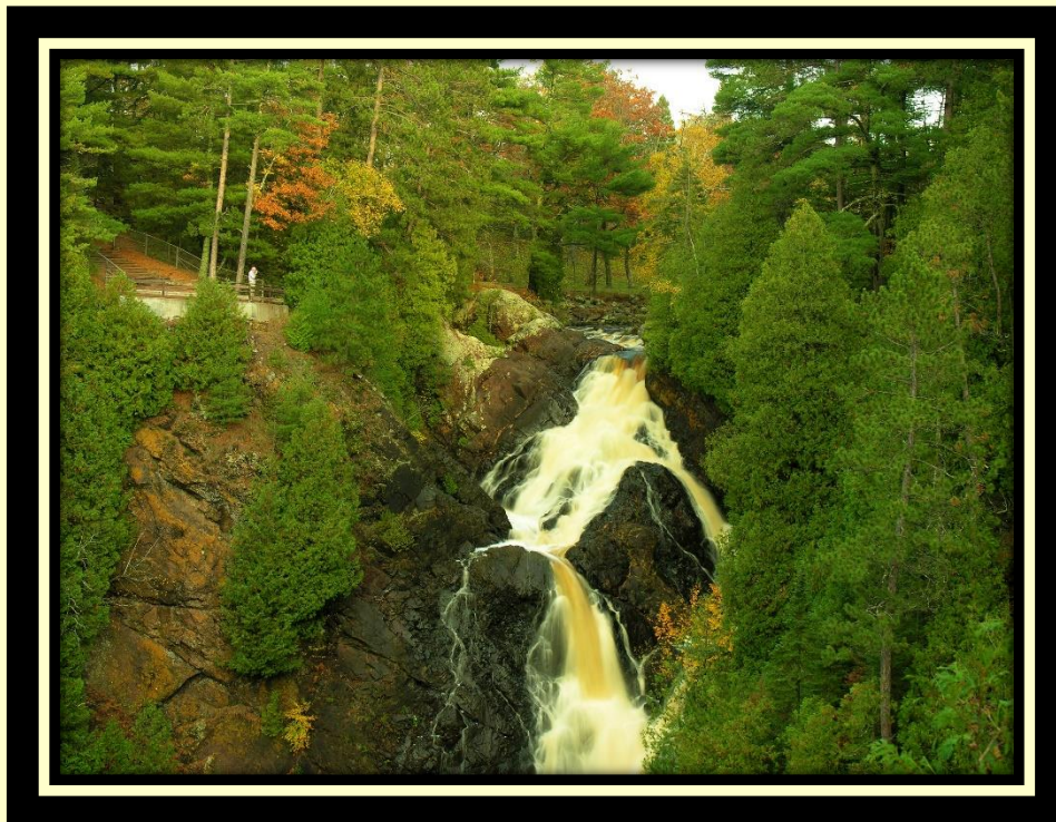
Close up view of the top of Big Manitou Falls in fall