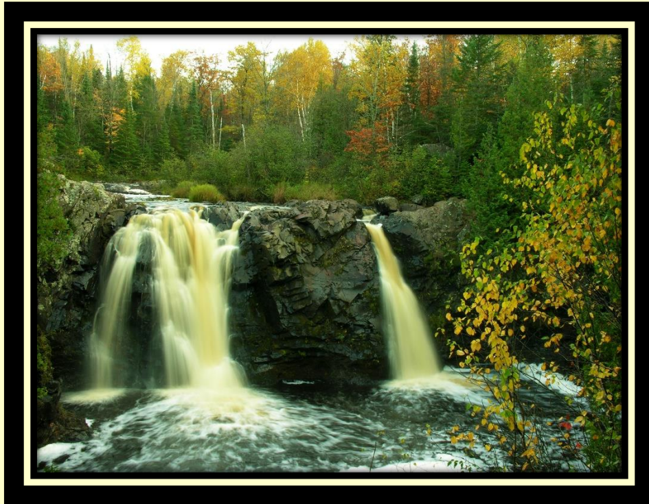
View of Little Manitou Falls in fall, photo spot#3

Extended Route: There are several options for extended hiking but the best one is the hike down the hill from the Big Manitou Falls overlooks to the Black River . Plenty of things to explore at the river. Or you can do part of the Lumberjack trail that connects with the Little Falls Loop. This is an extensive trail so don't get too far out.