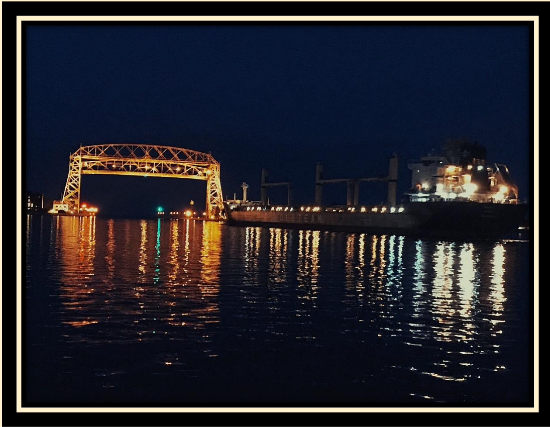
View from behind Bayfront Park, photo spot#1

Highlights: There is something for everyone in the world class tourist area with great views of the harbor and lake. Along with that a list of activities, restaurants and breweries second to none.