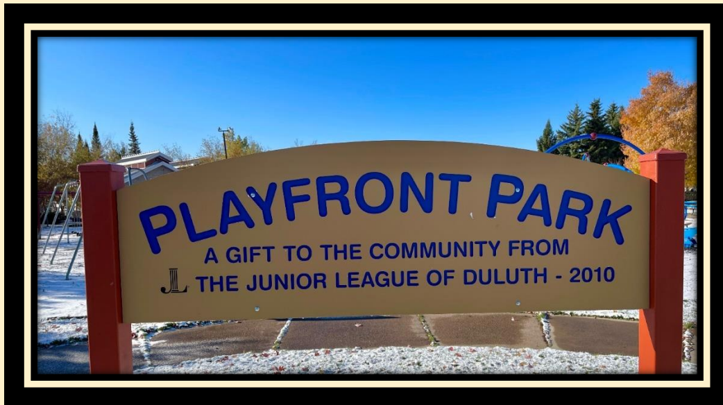
Playfront park next to Bayfront Park