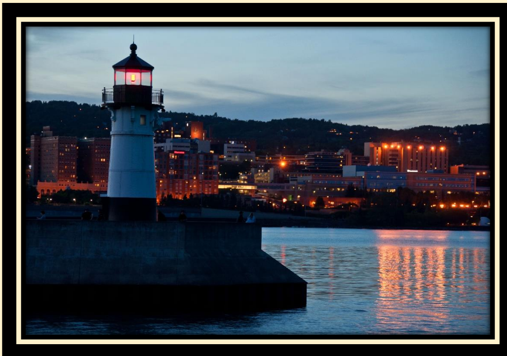
View from the south walkway looking north toward downtown Duluth, photo spot #3