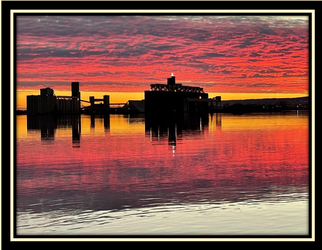
View looking west from the end of the ship canal walkway, photo spot #2