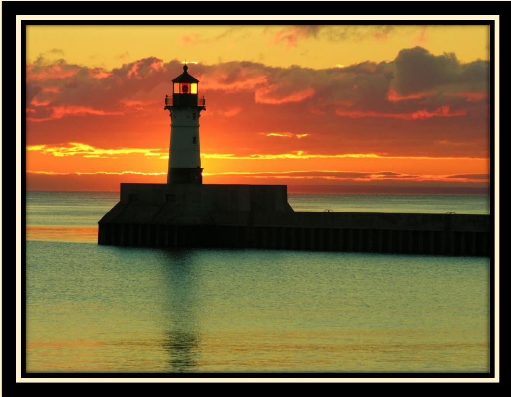
View from Duluth Lakewalk looking southeast, photo spot #4