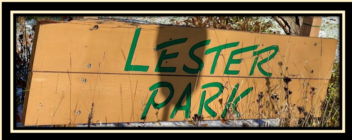
Lester Park Sign