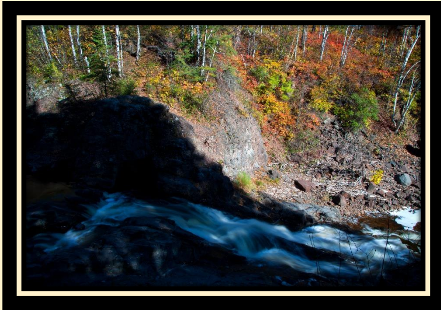
View of cascade about a half mile up trail, photo spot #3