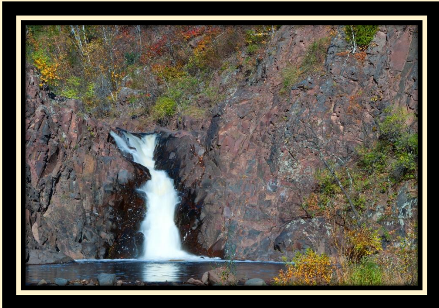
View from river level of Lester River Waterfall, photo spot 2

Family Friendly Route: Parking in the Lester Park lot there are many places to explore. You can walk down the bike trail just over the stone bridge and explore the waterfalls and pools of the Lester River. In the middle of the summer this is a favorite swimming whole for families . You can explore the trail along the river that leads from the parking area to a overlook of the Lester River Falls . Or you can take that same trail and cross the river on a pedestrian bridge to the trails on the other side. There is a great playground and picnic area in the middle of the park . On the other side of the park, you will find another pedestrian bridge that leads to a beautiful trail along Amity Creek and another waterfall . Head to Eighth Street Video on 47 th Ave. E. for candy or ice cream.