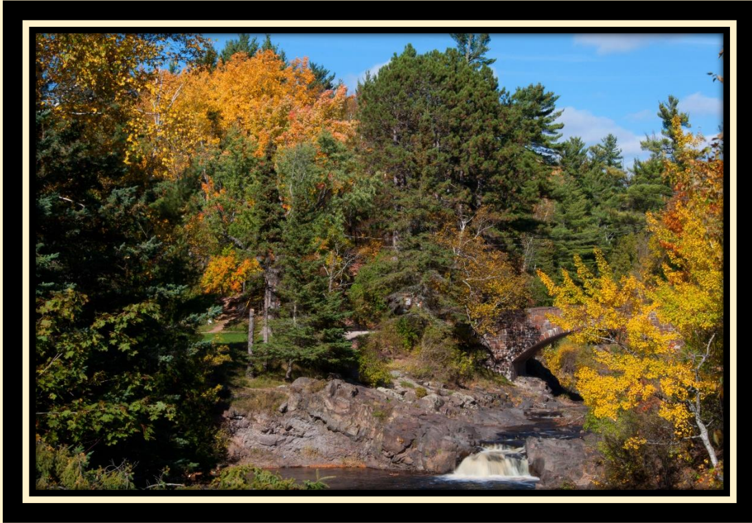
View of waterfall just below the stone bridge, photo spot #1

Highlights: This is a beautiful trail heading up through a pine forest along the Lester River. There are several waterfalls along the first half mile and last half mile of this route.