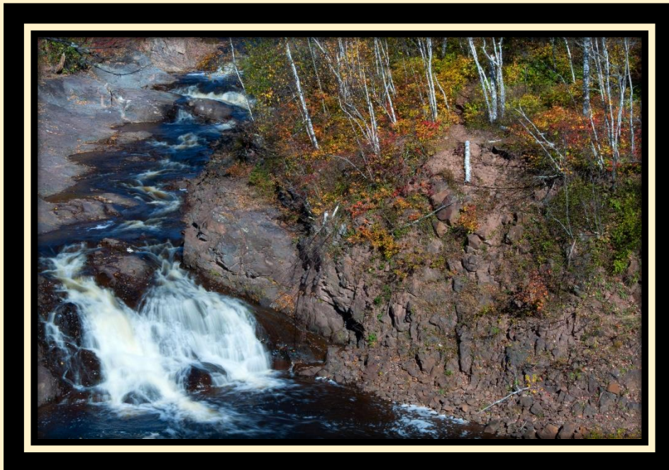
View of a series of waterfalls about one and one third miles up trail, photo spot #4