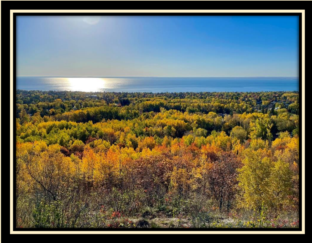
View from Hawk Ridge, photo spot #2