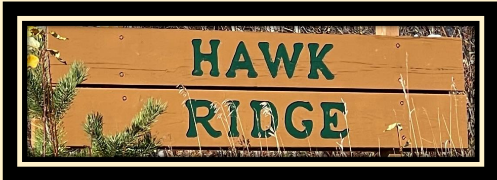
Hawk Ridge Park Sign