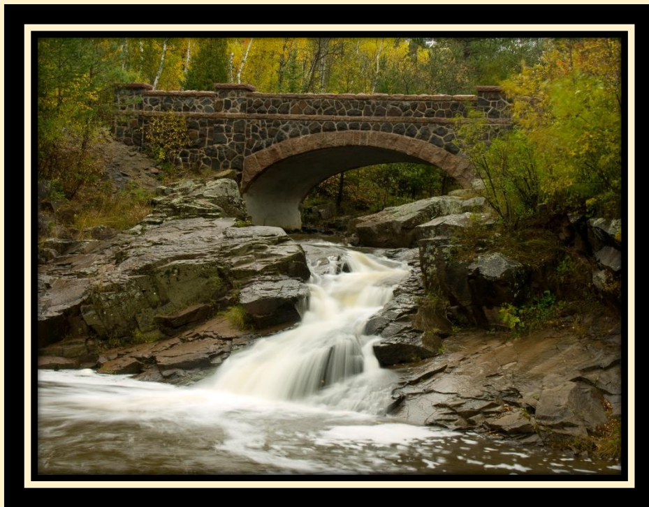
View of waterfall below bridge # 6, photo spot #3