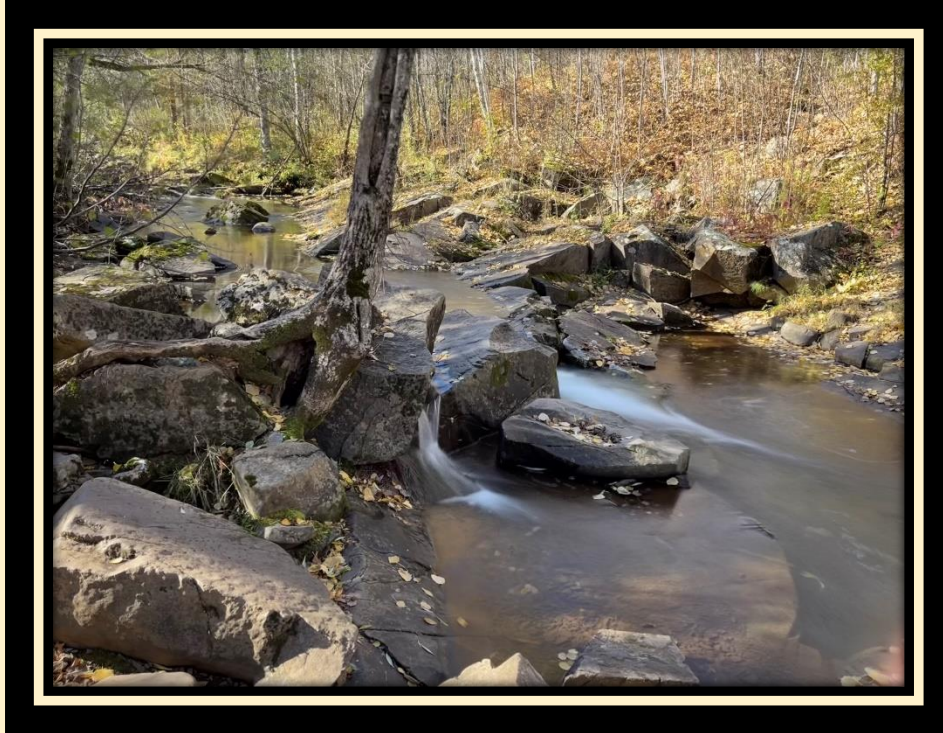
View from bridge on Snively Trail, photo spot #4.

Extended Route: When you get to the sixth bridge, you can continue down seven bridges road and look for a trail to the left that leads to the E. Amity bike trail . Follow this back up the hill until it merges back with Seven Bridges Road.