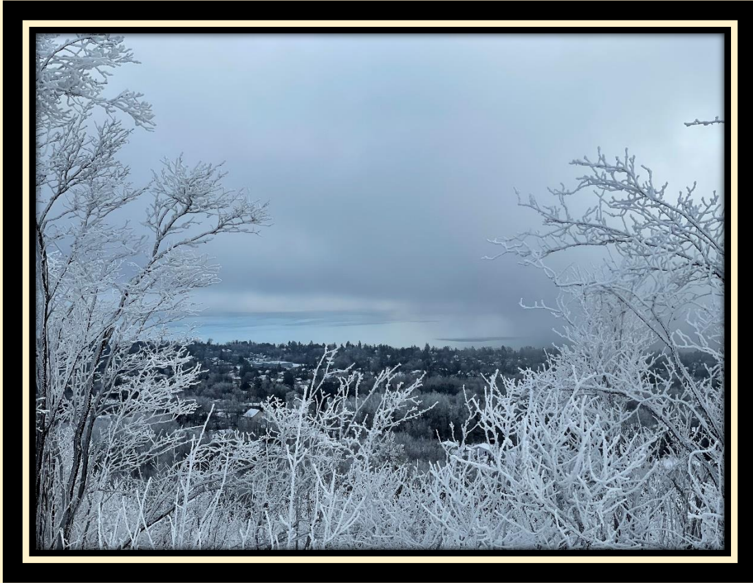
View from Skyline parking area, photo spot one

Highlights: The overlooks on the E. Skyline of Lake Superior and the Lakeside neighborhood are truly spectacular. The historic stone bridges and pine forest are remarkable. There are plenty of wildflowers along the Snively Trail in spring, summer and fall. Fall colors, spring blossoms and an occasion ice event on the ridge are a photographer's dream.