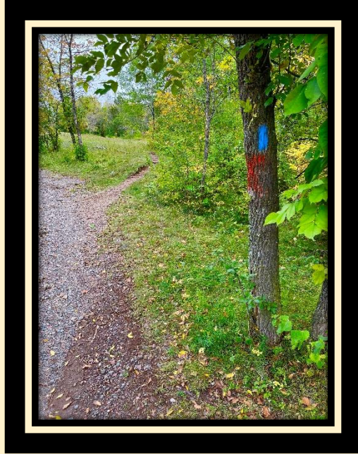
LSHT above the Piedmont Ave. Bridge