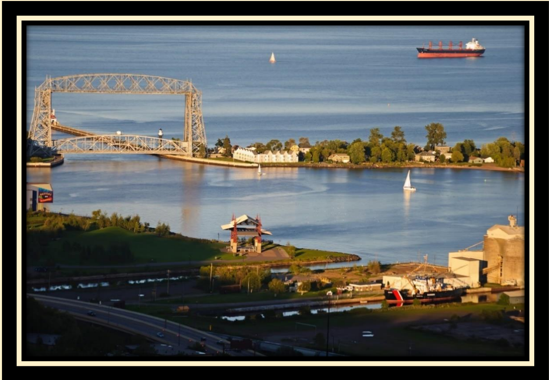
View of Duluth Harbor from Enger overlook, photo spot #4