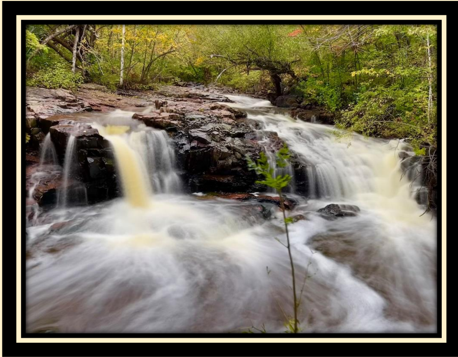
Waterfall just above the 10 th St. Bridge, photo spot #2