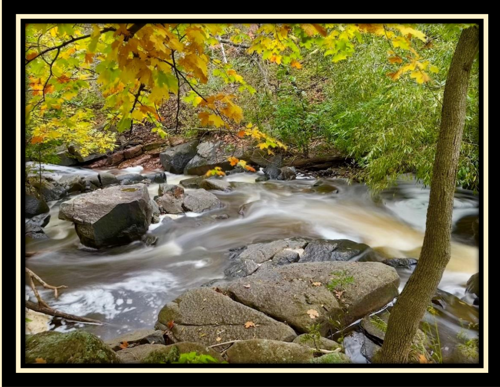
A beautiful spot along the Lincoln Park Trail