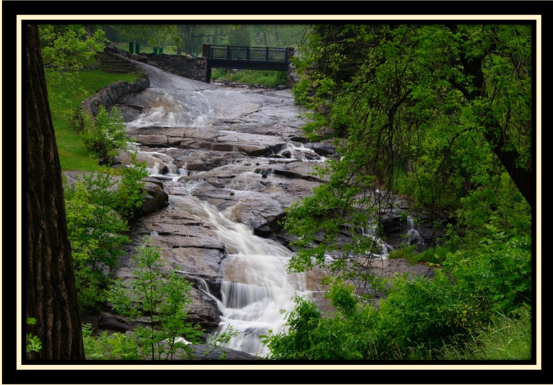
View from bottom of large waterfall, off of 3 rd St., photo spot #1

Highlights: The multiple waterfalls, canyons and pools are spectacular. This is another great place for wildflowers in spring, summer and fall. The view from Enger Park is truly spectacular.