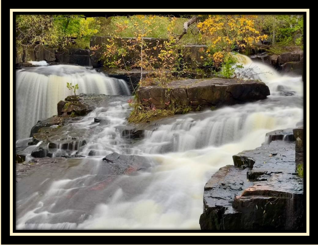
Waterfall just below the LSHT bridge, photo spot #3