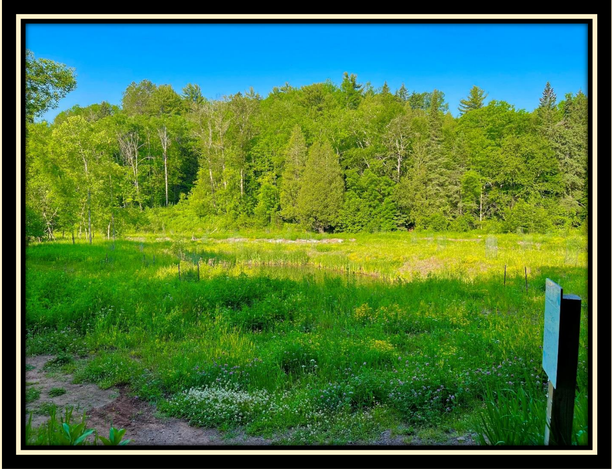
Mission Creek Basin

Extended Route: You have a choice of including the Ely Peak hike or continuing on the main LSHT towards Jay Cooke State Park.