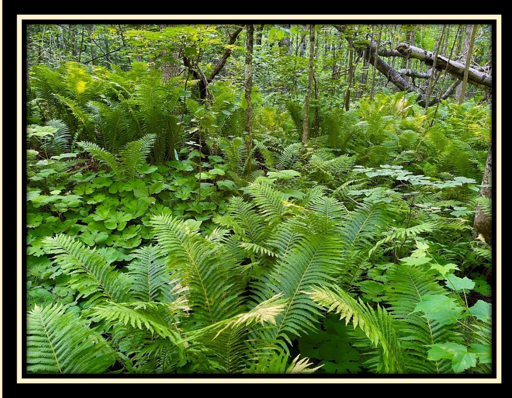
Ferns along Sargent's Creek