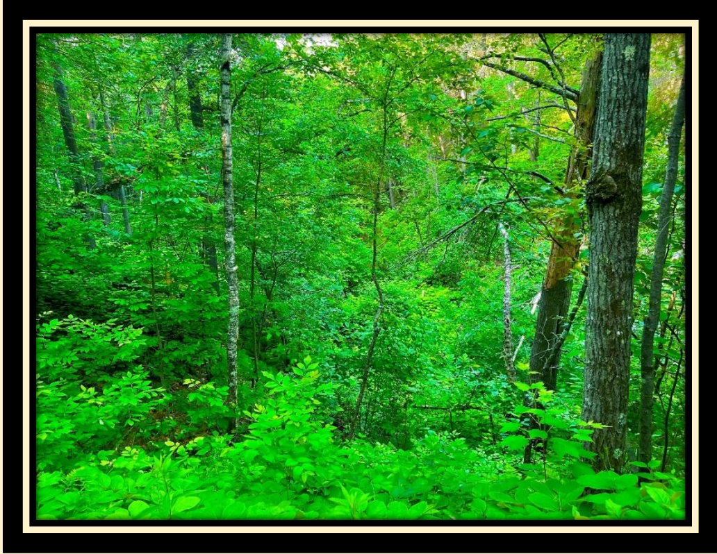
Overlooking Mission Creek Valley