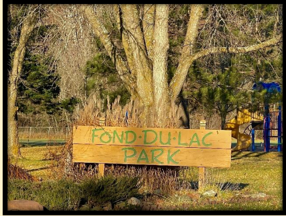
Fond du lac Park