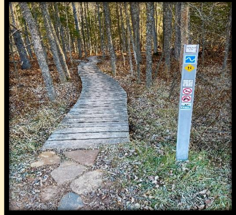
Indigenous Bike Trail