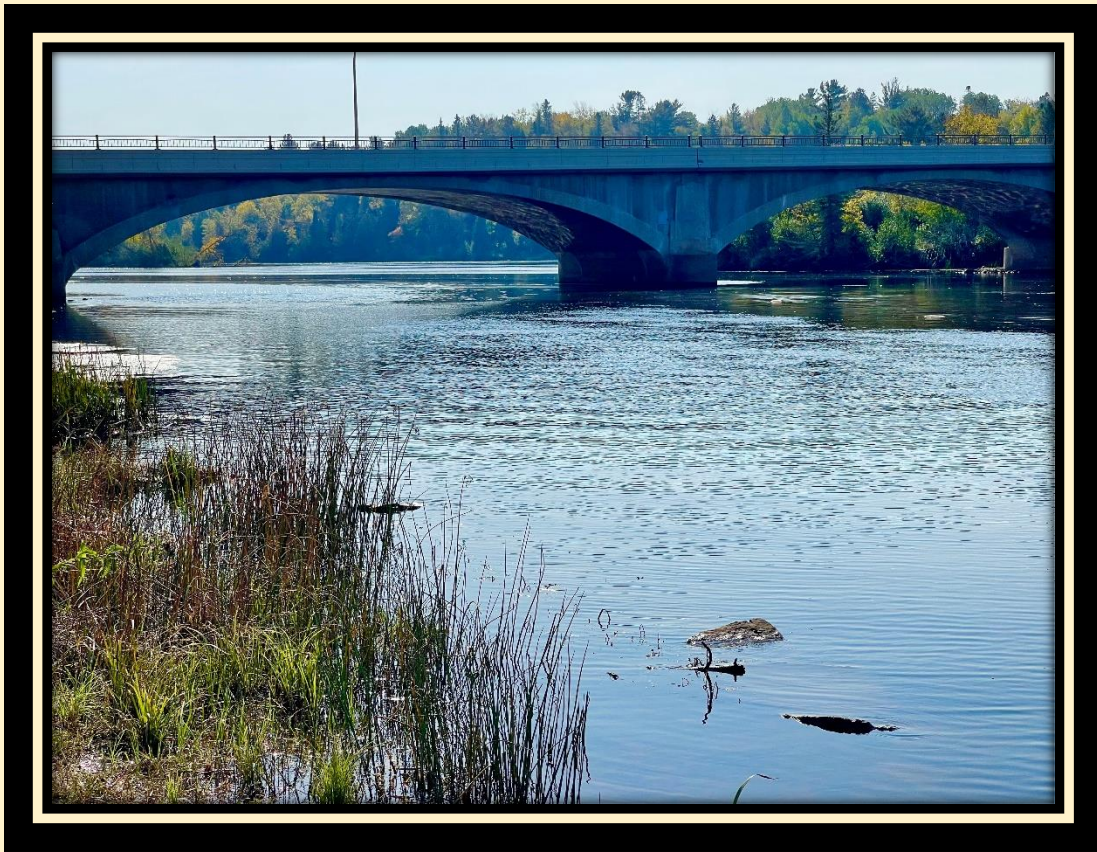
View of the historic Biauswah bridge, photo spot #1

Highlights: The historic highway 23 bridge ( Biauswah ) over the St. Louis River built in 1919. The remnants of the Chambers Grove sandstone quarry , which was used to build many a downtown Duluth building. St. Louis River bike trail. Playground and picnic areas with a boat launch to the river nearby. Migratory can often be seen in spring and fall on the river by the park. This spring there were white pelicans hanging out and, in the fall, Canadian geese.