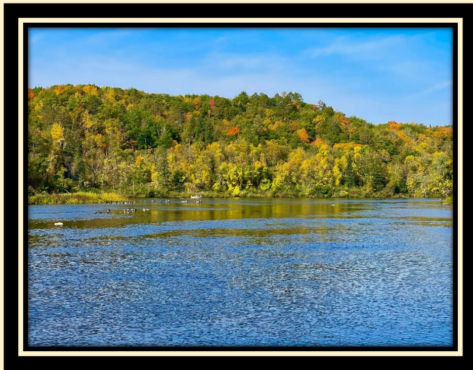
View of the St. Louis River from the quarry loop, photo spot#2

Family Friendly Route: There is an interesting half mile loop that brings you back to the sandstone quarry and a view of the river . The playground and picnic area are first class with plenty of parking .