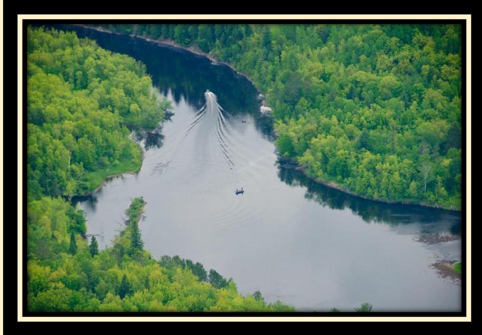
Ariel view of the St. Louis River just west of the bridge