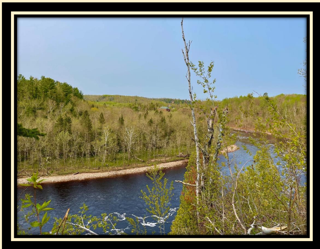
View from the overlook of the St. Louis River Trail in spring, photo spot#3