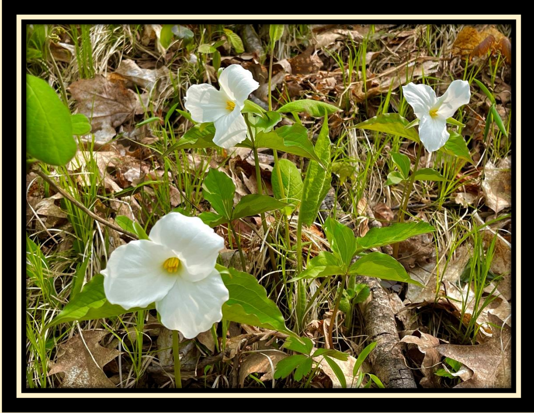
Trillium wildflowers in late may