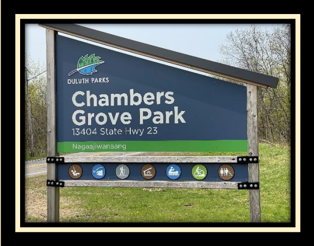
Chambers Grove Park Sign

Park and parking. The St. Louis River Bike Trail can be found on the left side of the restroom building. It is a gravel trail heading up the hill. Look for the signs below.