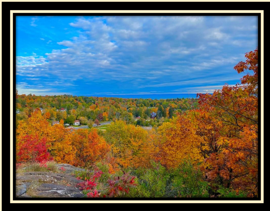
View looking south on Gazebo Point photo spot 2