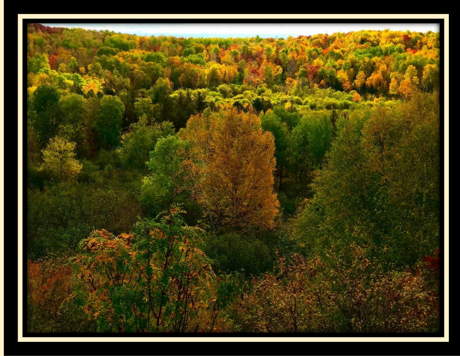
View from Rock Knob and photo spot #4