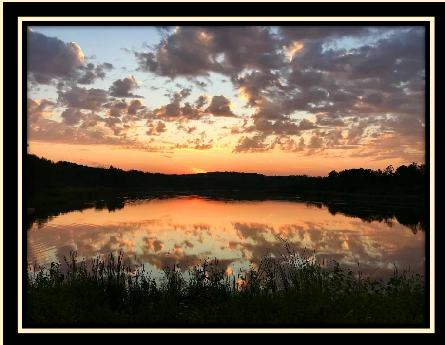
View Hartley Pond at twilight