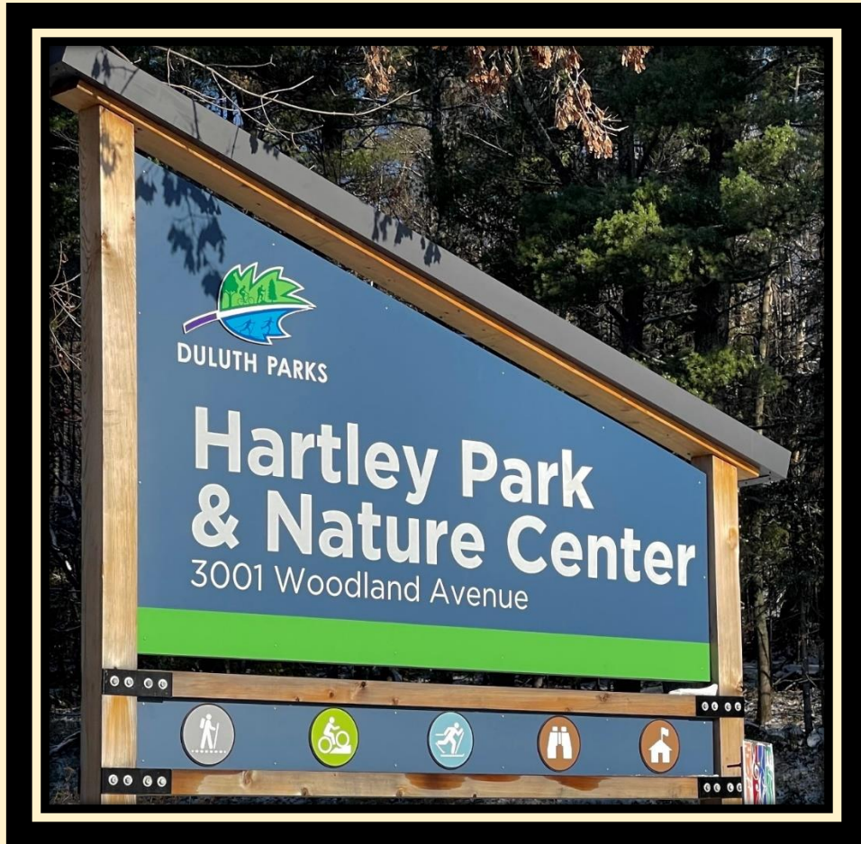
Hartley Nature Center Sign