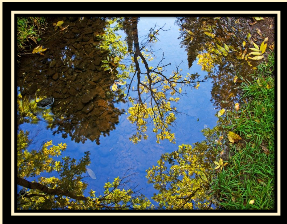
Fall reflection from the East Tischer Creek Bridge and photo spot three